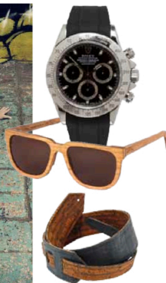
MATERIAL WITNESS Clockwise from top right: a Rubber B strap on the Rolex Daytona; cherry-framed Capital shades; a cork model from Cliff Belts off and on